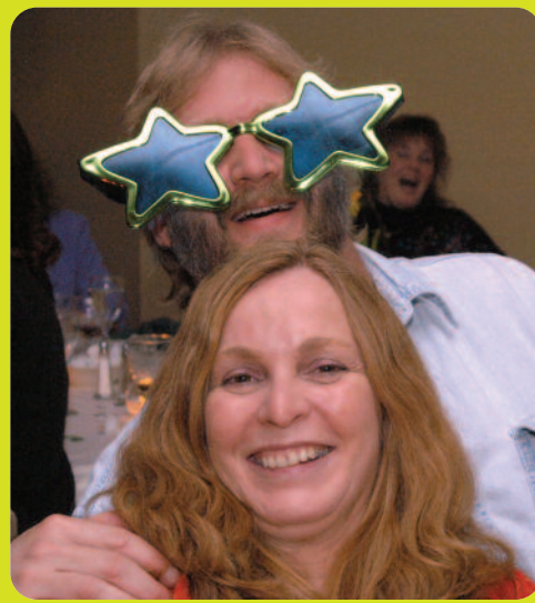
Friends and family alike joined in the spirit of the evening.