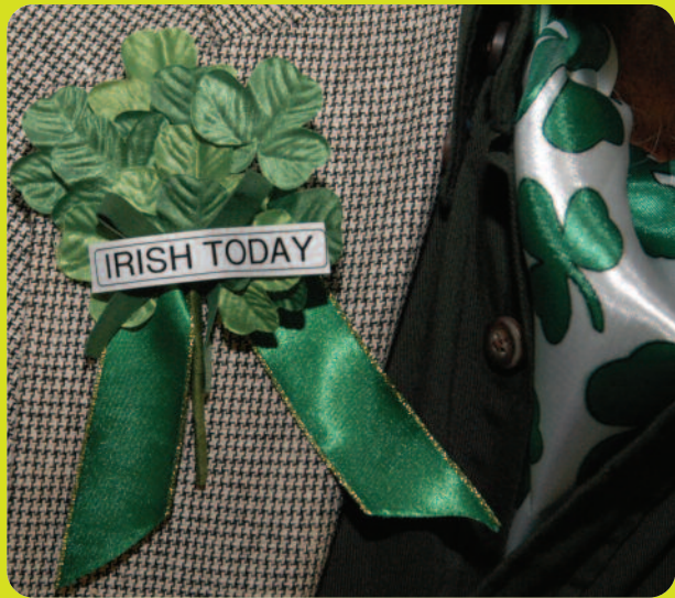
On St. Patrick's Day, everyone is Irish.