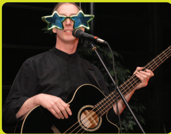
Celtic Kick...superstars in the making.